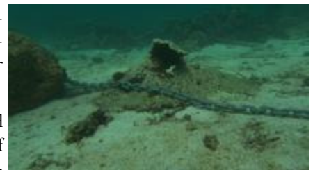
Anchor damaged coral reefs from Ningaloo reef in Western Australia