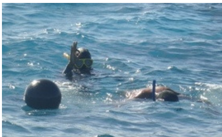
Anchor moorings are marked by buoys, such as this shown in the picture.

Village visits for dive tourists were trialed in three of these villages by Nai’a Cruises, which everyone thoroughly enjoyed. It is hoped that in the future, more dive operators will make use of these moorings to join in the village visit fun!