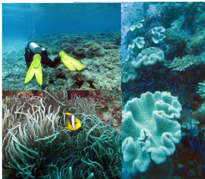
Habitat pictures from Kubulau

As more information is available, the Kubulau Resource Management Committee (KRMC) will be updated to help them make better resource management decisions.