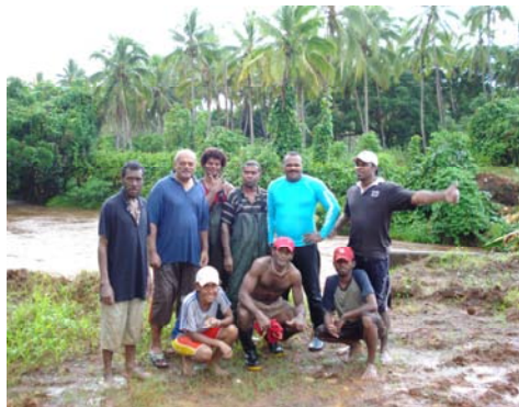
The wet season survey team