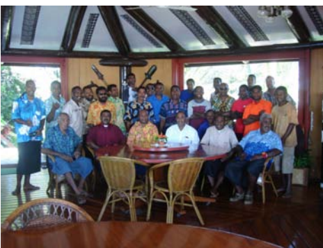
Participants of the Kubulau district MPAs blessing

THE GOAL OF ECOSYSTEM-BASED MANAGEMENT IS TO MAINTAIN AN ECOSYSTEM IN A HEALTHY , PRODUCTIVE AND RESILIENT CONDITION SO THAT IT CAN PROVIDE THE SERVICES HUMANS WANT AND NEED.