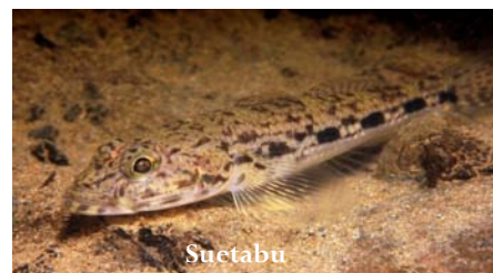
Some native gobies from Kubulau