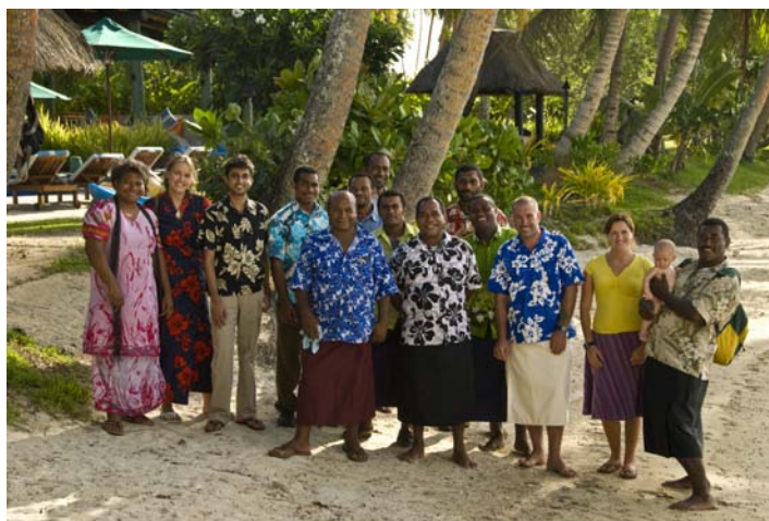
Participants of this December's Kubulau Stakeholder's Meeting

This meeting is an important platform for the stakeholders, to offer and re-