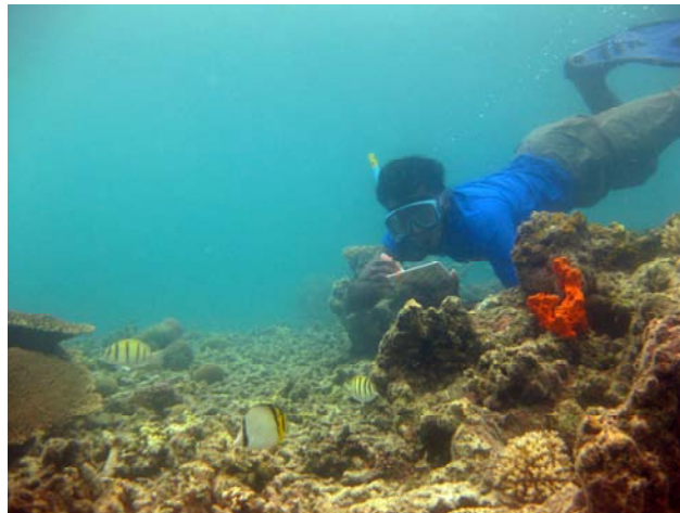
One of the Community volunteers counting the Butterfly fish

In November, many different dive organisations and resorts throughout Fiji participated in 'The Great Fiji Butterfly Fish Count' survey. This nationwide survey was conducted to establish the health of Fiji's coral reefs. Butterfly fish are considered by some scientists as good indicators of reef health; the greater the abundance of these fishes the healthier the reef ( www.coral.org ). On Vanua Levu, the Kubulau District was the only community taking part in this survey. This emphasised their commitment to actively help protect their coral reef. Volunteers from within Kubulau district together with Greenforce spent the day completing several 30 minutes snorkels along the Nasonisoni Passage to record the fish numbers. The data collected from the surveys has been passed on to Coral Reef Alliance for analysis and the results will be pre-