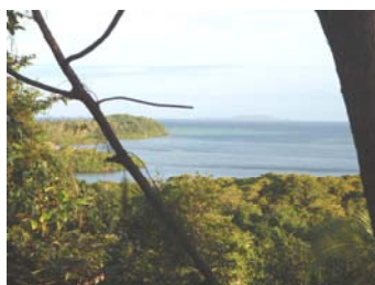
How will this look in 30 years time from now?

THE GOAL OF ECOSYSTEM-BASED MANAGEMENT IS TO MAINTAIN AN ECOSYSTEM IN A HEALTHY , PRODUCTIVE AND RESILIENT CONDITION SO THAT IT CAN PROVIDE THE SERVICES HUMANS WANT AND NEED.