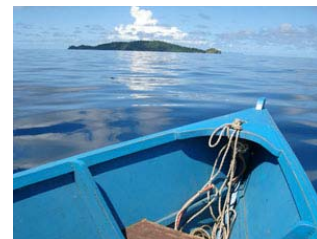
Namena Island and MPA as seen from Kubulau qoliqoli.

Stakeholders including WCS. It is one of many projects towards providing the community with small business opportunities. Village visits and associated activities can generate income for community projects, thus bringing more direct benefit to Kubulau from the Namena MPA whilst protecting the marine ecosystem upon which the tourism relies. KRMC administer admission fees to Namena MPA.