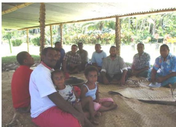
Meeting at Kiobo to discuss Kubulau's Ecosystem Based Management