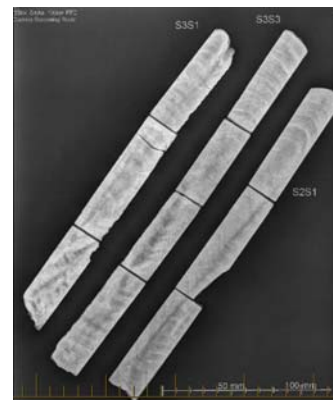
Coral core x-rays showing bands deposited by the corals.

pieces from 3 corals from Kubulau were taken to the Australian National University to be x-rayed. Two of the corals were collected from reef near the Yanawi River mouth and the other was collected near Namena. The results are currently being analysed which will show how the water quality has changed over time. Once the analysis has been completed, EBM Kubulau Bulletin will report fully.