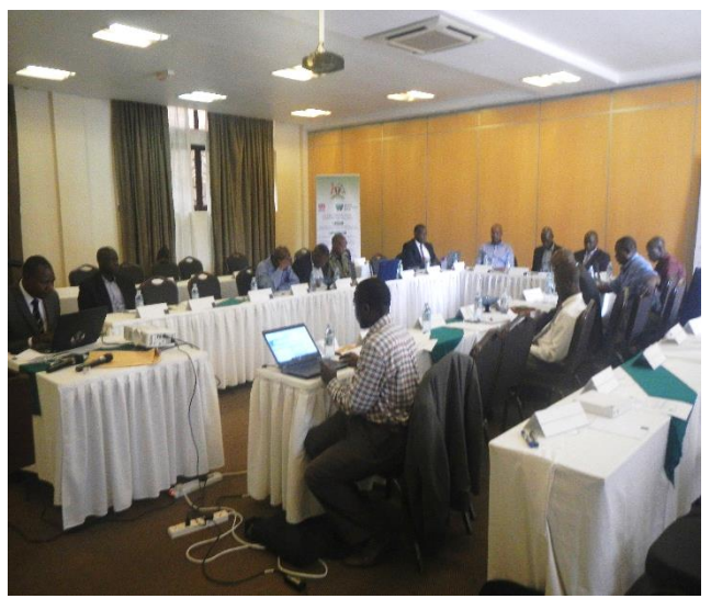
Participants at the inception meeting

By the end of the meeting, participants had a clear understanding of the project goals, objectives and scope and implementing partners got better understanding of their roles in the implementation and monitoring of the project. In addition, a few changes to the logframe and activities were proposed to reflect the conform to the current situation.