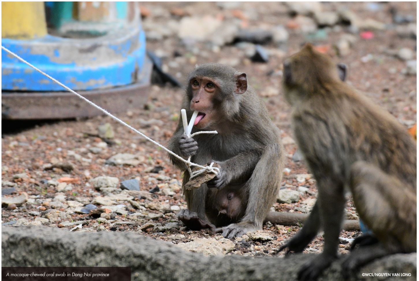
A macaque-chewed oral swab in Dong Nai province

IMPLEMENTATION PERIOD: September 2018 – December 2021