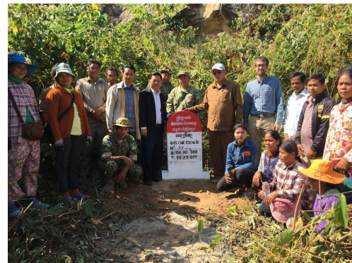
Stakeholders stand in front of a concrete pole that marks boundary of Phnom Tbeng Natural Heritage Park.

Preah Vihear Provincial authorities, Department of Environment (DoE), local communities and WCS have successfully completed the demarcation of the Phnom Tbeng Natural Heritage Park (PTNHP). This involved clearly delineating the protected area through the placement of 40 concrete posts at key locations on its boundary. The demarcation paves the way for rangers to patrol the park and enforce forest and wildlife protection laws.