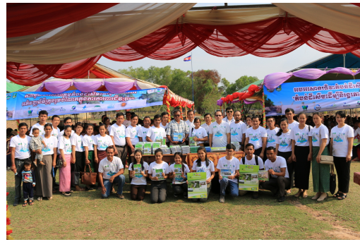
Stakeholders are showing promotional materials, calling for support and individual action to protect Cambodia's wetlands.

About 1,000 people from the Ministry of environment (MoE), WCS, provincial and local authorities, communities, teachers and students marked the celebration of World Wetlands Day at Chea Sim High School, adjacent to the Northern Tonle Sap Protected Landscape (NTSPL), in Stung District of Kampong Thom Province. The purpose of this event is to raise public awareness of the importance of wetlands for local livelihoods and biodiversity conservation, and inspire individual action to protect it. The participants also took a field visit to see the Critically Endangered Bengal Florican and other waterbirds at the NTSPL.