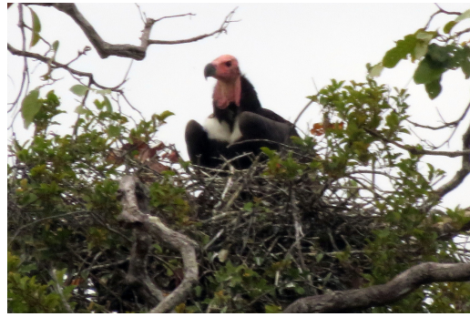
A Red-headed Vulture on the nest inside Chhep Wildlife Sanctuary.

Three nests of the Critically Endangered Red-headed Vulture were found in Chhep Wildlife Sanctuary by conservationists from the Ministry of Environment (MoE), Wildlife Conservation Society (WCS) and local communities. The population of this species in Cambodia is possibly less than 50 individuals. These nest discoveries give hope that conservation efforts may save this species from extinction.